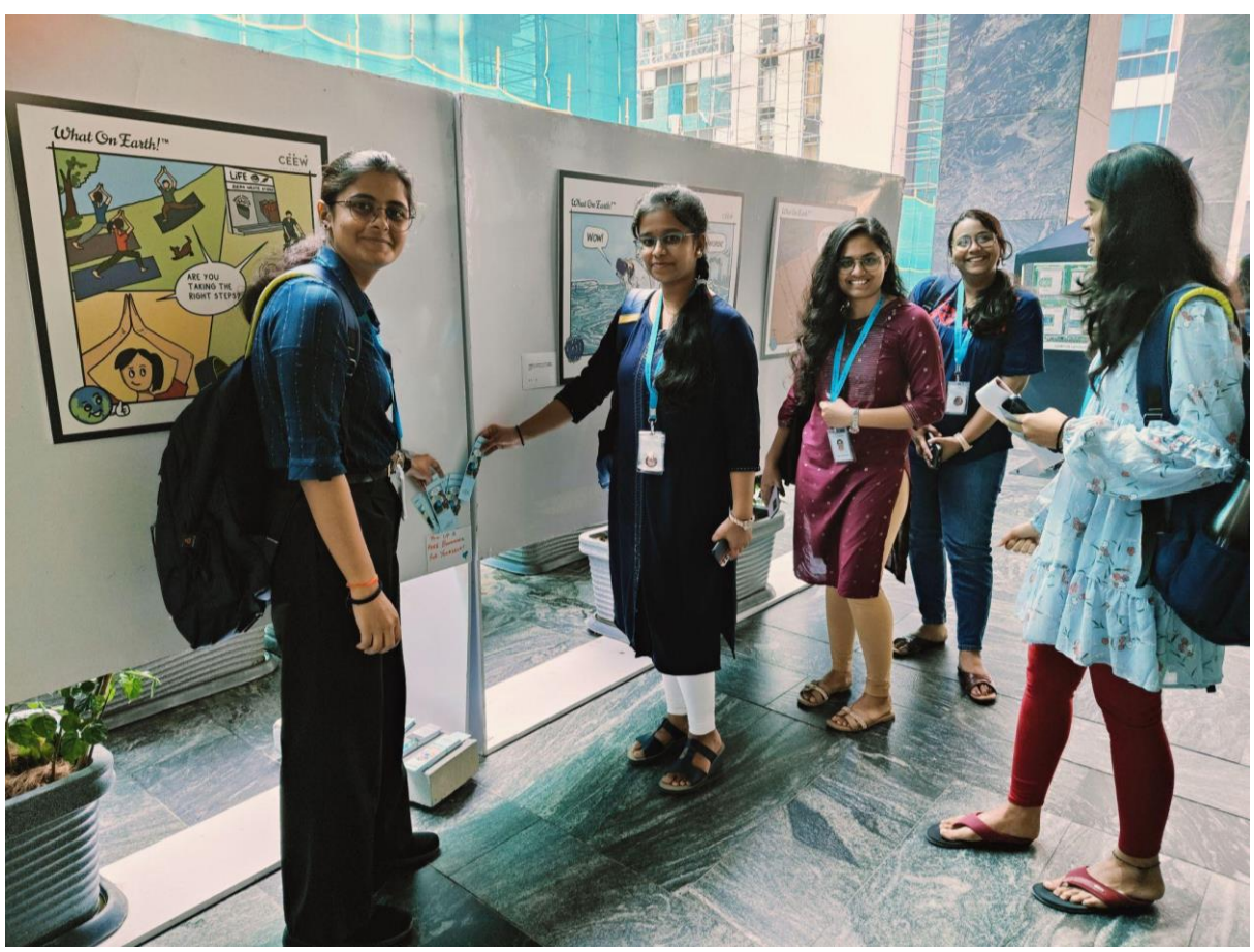
Attendees posing with the exhibits and taking their share of What On Earth!® bookmarks, Hyderabad

finance, WOE humanises sustainability, presents fresh perspectives and solutions, and challenges existing biases and mindsets. By reframing the traditionally Global North-dominated climate narrative, WOE amplifies the voice of the developing world, making these global environmental challenges a part of everyday conversations.